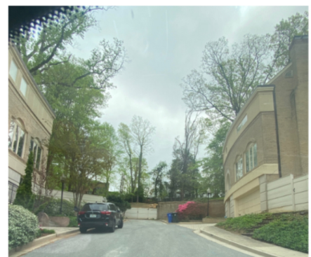
direct view of front entry