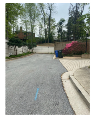
direct view of front entry