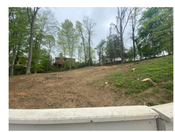
removed site vegetation