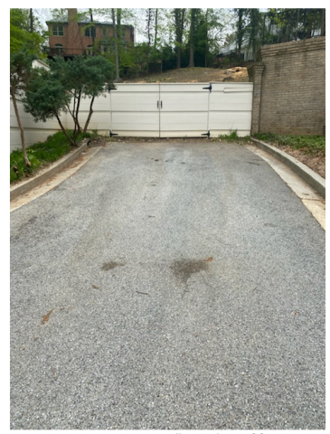
direct view of front entry